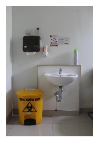
Figure 7. The washbasin unit and medical waste bin inside the KIA's room.