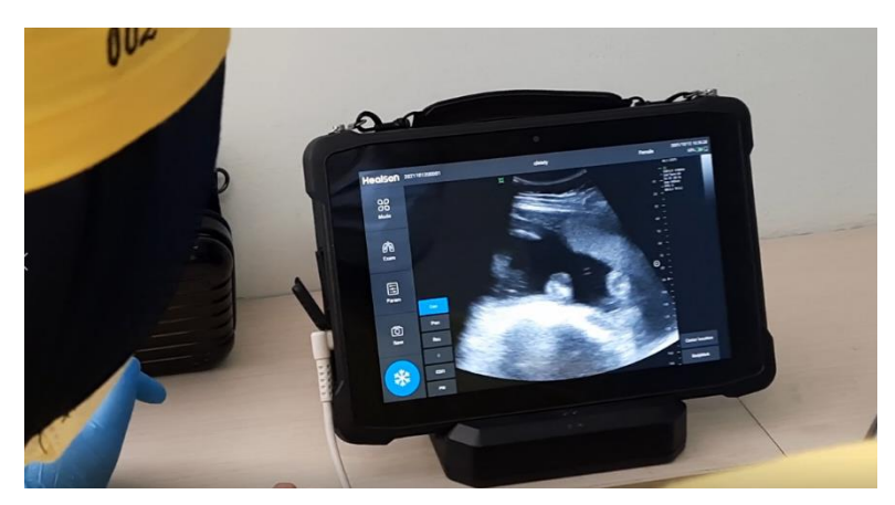
Figure 2. The doctor is looking at the ultrasound image

The following below are photos of the facilities of sexual and reproductive health care services.