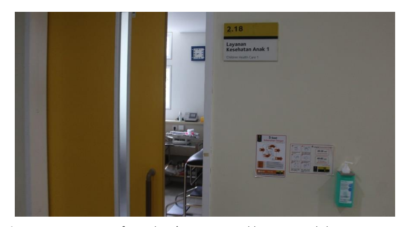
Figure 5. Front view of KIA clinic's room. Hand hygiene and their instruction are hanging on the wall