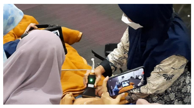
Figure 4. Our doctors are conducting training on the use of external ultrasound device