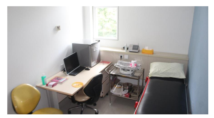
Figure 6. Inside view of KIA clinic's room. There are PC, bed, refrigerator, chairs, medical trolley, baby scale, and little stuffs.