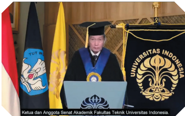
Ketua dan Anggota Senat Akademik Fakultas Teknik Universitas Indonesia.

Ia menjelaskan sejumlah tantangan terkait kebutuhan air saat ini, seperti pengelolaan air hujan dan adaptasi terhadap perubahan iklim, pemanfaatan energi baru terbarukan (EBT), efisiensi energi, dan perhatian terhadap emerging kontaminan. Ia pun menawarkan sejumlah inovasi untuk mengatasi permasalahan air dengan pendekatan multidisipliner, salah satunya rumah pintar dan pemanfaatan internet of things (IoT) dalam pencegahan bencana terkait air.