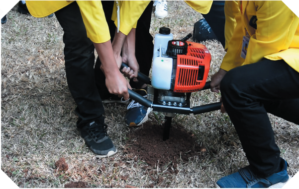
Pembuatan lubang biopori di area kampus. Making biopore infiltration holes on campus.