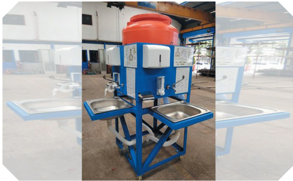
Alat cuci tangan keliling Moveable hand washers